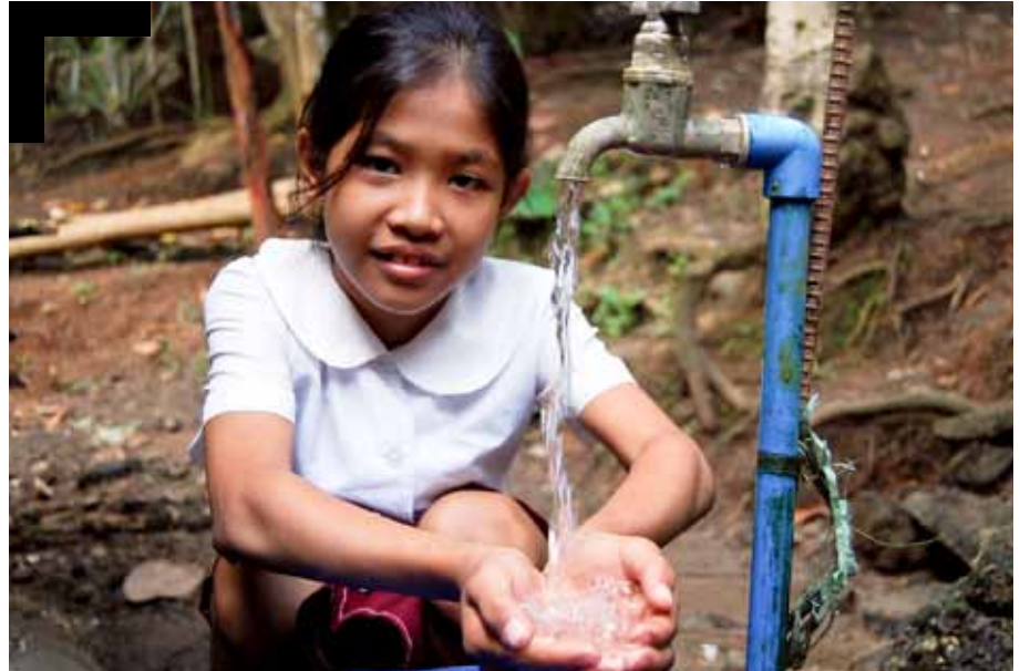
CRISLYN FELISILDA/WORLD VISION

Source: Progress on Sanitation and Drinking Water , WHO and UNICEF, 2010