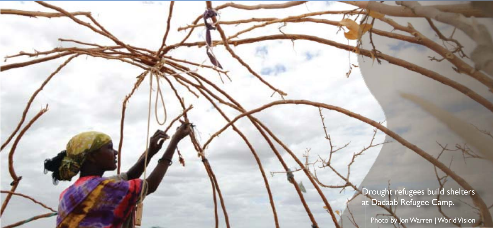
Drought refugees build shelters at Dadaab Refugee Camp.