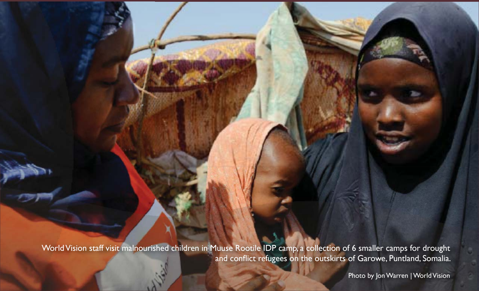
World Vision staff visit malnourished children in Muuse Rootile IDP camp, a collection of 6 smaller camps for drought and conflict refugees on the outskirts of Garowe, Puntland, Somalia.